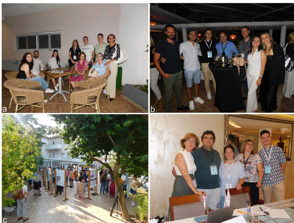
Figure 9. Glimpses into social scenes during a coffee break (a), the Monday night cocktail party (b), the Thursday morning poster session (c), and the conference desk during usual working hours (d).