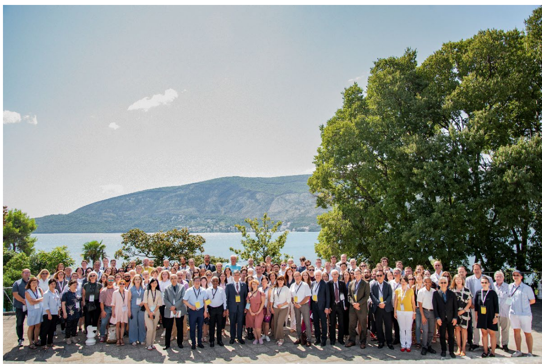
Figure 1. A group photo with many of the attendees taken on the first day of the conference.

YUCOMAT has been an international meeting since its founding. From the first conference in the new century, it became mandated that all presentations be in English, the language that distilled itself in the second half of the 20th century as the official language of science, following the periods of dominance of German and, even earlier, French [2]. This year's conference took place between September 3 and September 8 in Herceg Novi, Montenegro, its home since founding. The attendees (Figure 1) came from 28 different countries of the world, the most represented among which were eastern European countries, namely Serbia, Ukraine, Poland, Czech Republic, Lithuania, Romania, and Montenegro. Research centers and academic institutions from countries such as the United States, Germany, Republic of Korea, France, and China sent relatively numerous delegations, too. Outside of the five plenary sessions and the special symposium on the biological assessment of MXenes, the conference contained five symposia: (i) advanced methods in synthesis and processing of materials; (ii) advanced materials for high-technology applications; (iii) nanostructured materials; (iv) eco-materials and eco-technologies; and (v) biomaterials.